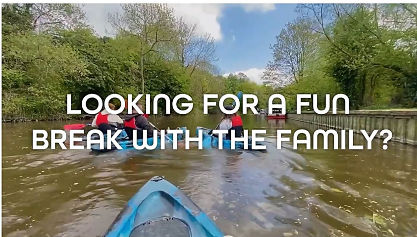
Fitcation - Active Escapes in Leicester & Leicestershire

A series of four promotional videos has been created to promote the campaign on social media platforms, see them here: Fitcation - YouTube playlist.