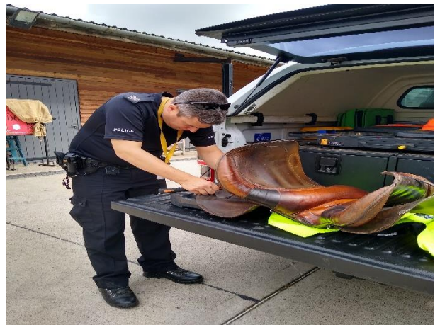
PC Statt 3004 – Tack Marking at Pinwall Feeds.

If you can use large objects to prevent field access – please do so’.