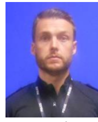
PC 4579 Heath