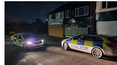
Burglary Patrols in Groby