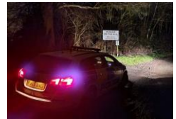
Higham on the Hill