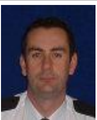
PS 1864 Patterson