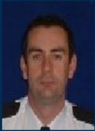
PS 1864 Paterson